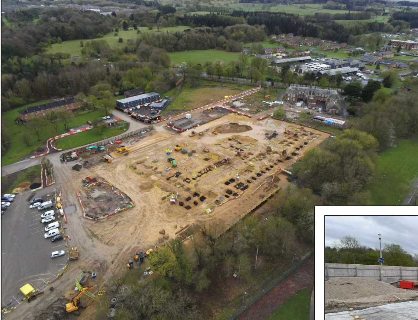
The footprint of the building can now be made out in the overall site