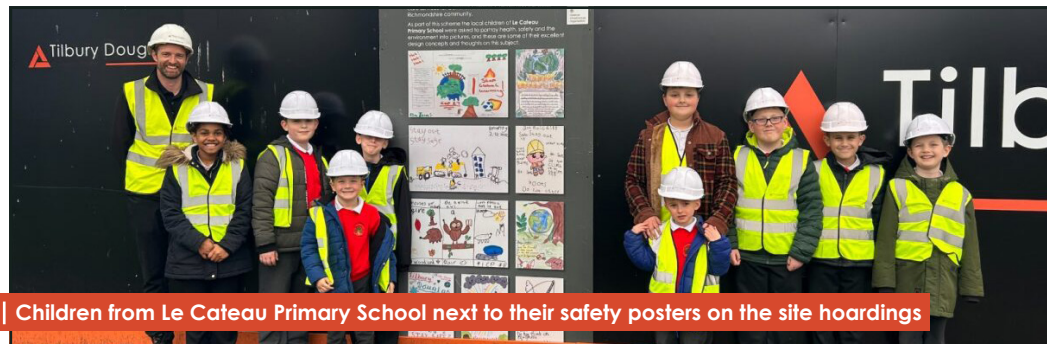
Children from Le Cateau Primary School next to their safety posters on the site hoardings