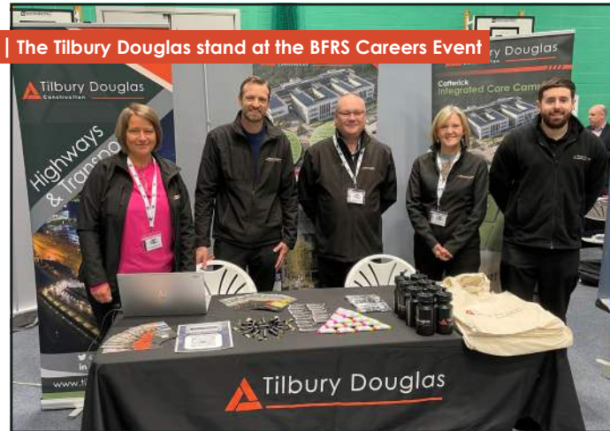
The Tilbury Douglas stand at the BFRS Careers Event

As part of the Integrated Care Campus project we are committed to ensuring the project benefits local people, by creating new employment, working with local schools and colleges, using a local supply chain and engaging with local community groups.